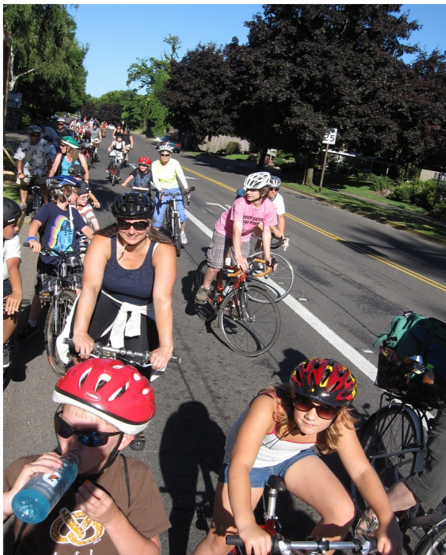
SmartTrips brings the community together for healthy, active and fun activities.