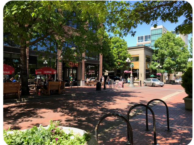
Climate-Friendly Areas are where people can live, work, and play without relying on a car.