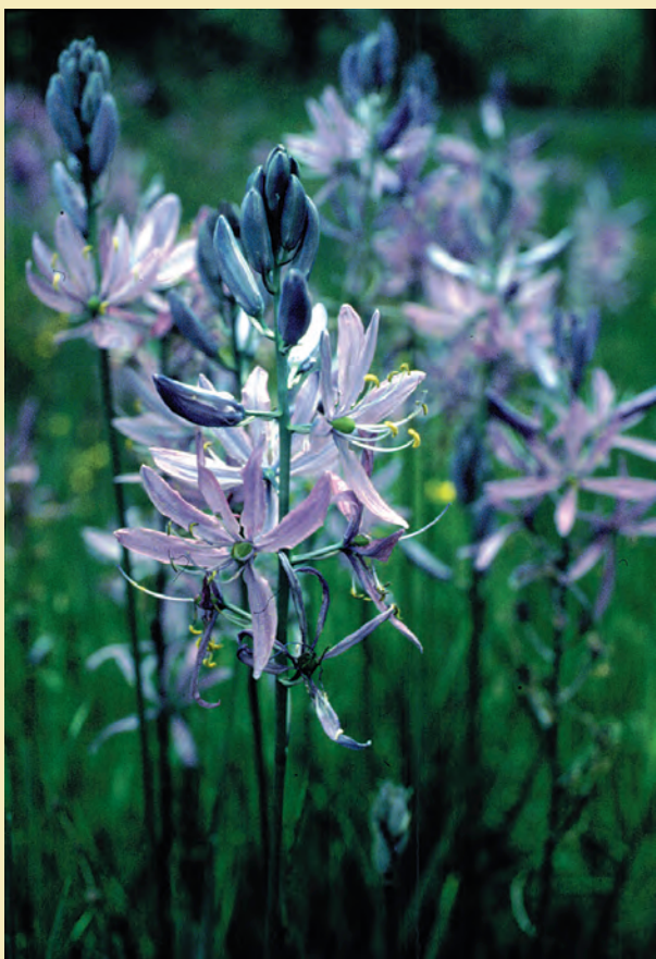
Camassia quamash (Camas lily)

Wetland plants have adapted to life in areas where water is present all or part of the year and play an important role in keeping water clean.