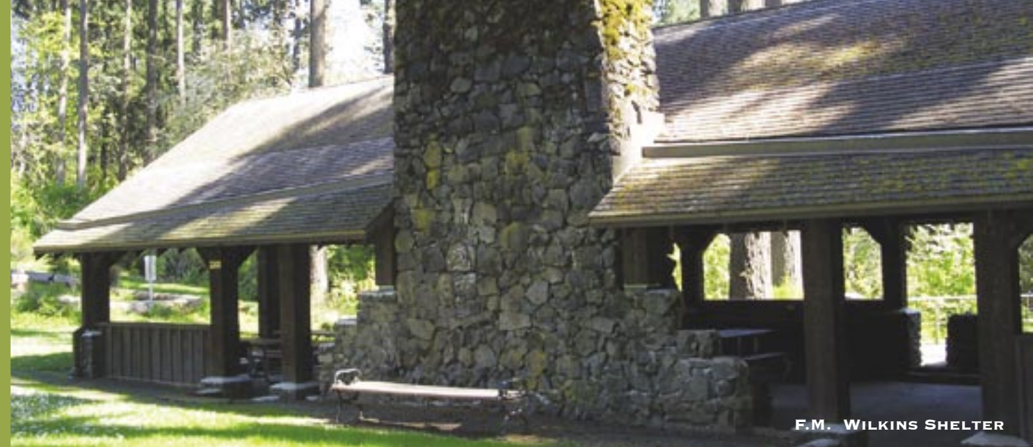
F.M. WILKINS SHELTER