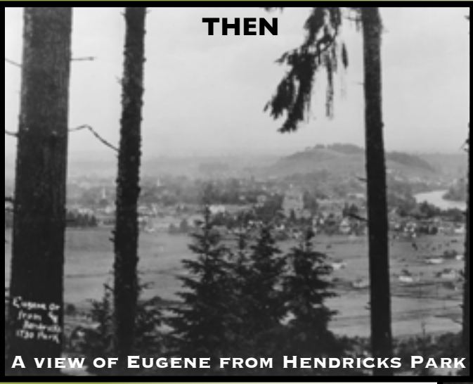
THEN A VIEW OF EUGENE FROM HENDRICKS PARK