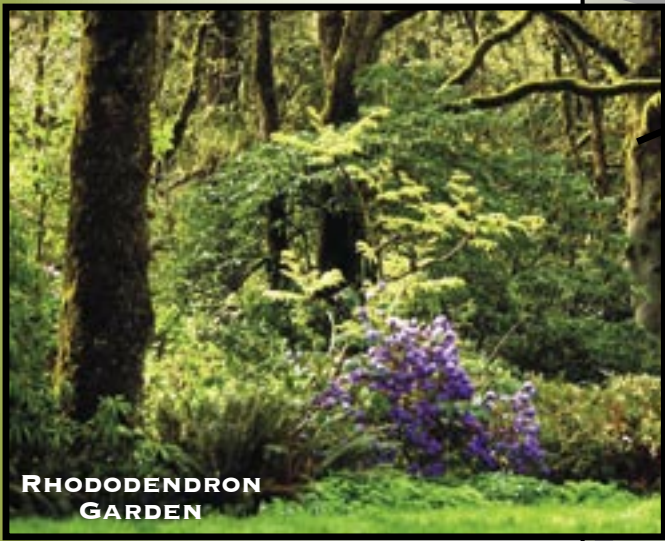
RHODODENDRON GARDEN

NATIVE PLANT GARDEN The Native Plant Garden was established in 2002 to feature the native plants of the southern Willamette Valley and demonstrate their use in various garden settings. This garden, as well as the Moon Terrace adjoining the F.M. Wilkins Shelter, was made possible by the family of Mary Rear Blakely, noted landscape architect Jin Chen, and many hours of volunteer labor. This garden serves as a living bridge between the Forest and the Rhododendron Garden.