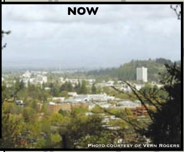
NOW PHOTO COURTESY OF VERN ROGERS