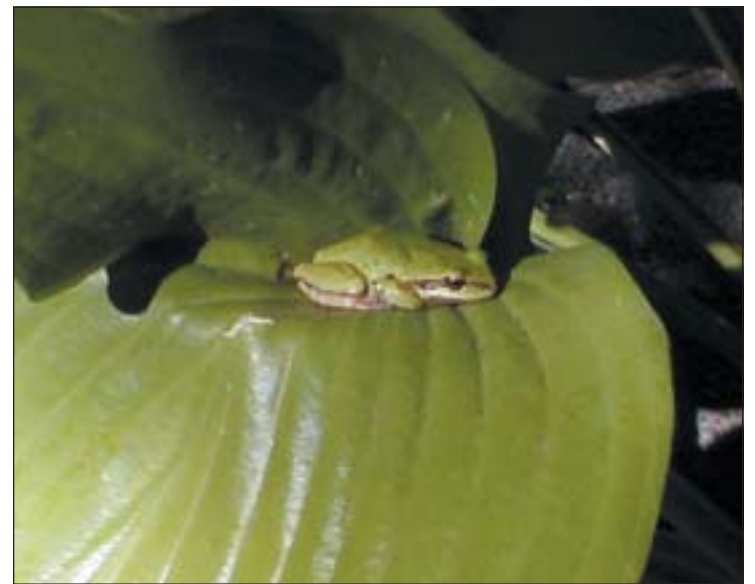
This little Pacific Treefrog has found a comfortable place to rest in the garden.

Pacific Treefrogs, like all other creatures, need clean water to live in order to survive. What can you do to make sure our local streams