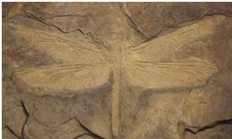
Dragonfly fossil

Dragonfly fossils (species meganeura, below) have been found measuring 30 inches across. The largest dragonfly living in the world today is 7 ½ inches across and lives in Costa Rica.