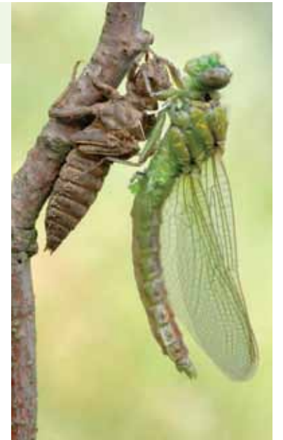
Most of a dragonfly's life is spent as a nymph in water. The photo above shows the nymph shell on a branch and the new adult dragonfly.

Large swarms of dragonflies sometimes migrate along Oregon's coast. Scientists are not sure why the dragonflies travel this way, and have asked citizens to help report these swarms so that we can understand this behavior better. One thing we do know for sure is that keeping water clean—free from pesticides and other toxic chemicals—helps these beautiful insects live and grow in our community!