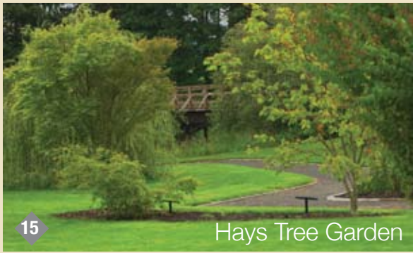
15 Hays Tree Garden