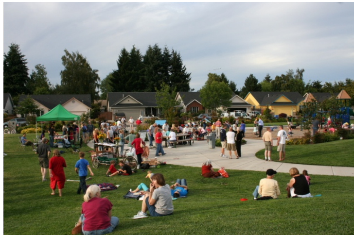
Filbert Meadows Park Celebration

The celebrations were kicked off with a dedication from Mayor Kitty Piercy and featured everything from polka music and a motorcycle show, to hand-cranked ice cream and sack races.