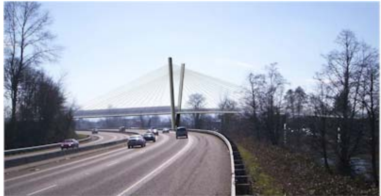
Renditions of how Delta Ponds Bridge will look when completed

A new elevated bicycle and pedestrian path and bridge will improve connections to Eugene's riverbank trail system and create local jobs. The Oregon Transportation Commission (OTC) on February 27, 2009, approved a $2.25 million Federal Highway Administration transportation enhancement (TE) grant to construct a 1,000-foot-long elevated pedestrian-bicycle path over the Delta Ponds and Delta Highway. The funding was part of the American Recovery and Reinvestment stimulus package.