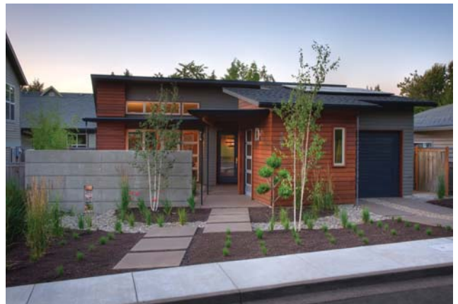
The Sage, LEED for Homes